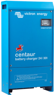
Centaur Battery Charger 24/30