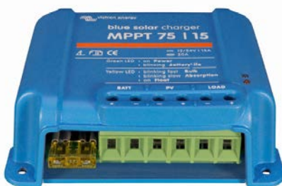
Solar charge controller MPPT 75/15