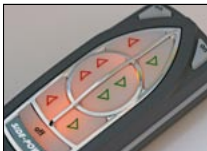
Illuminated buttons/Boat shaped layout