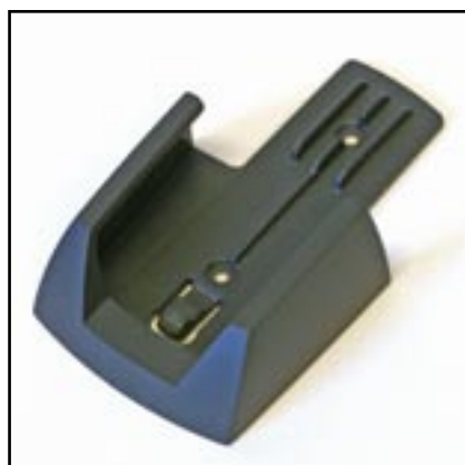
New and improved holder