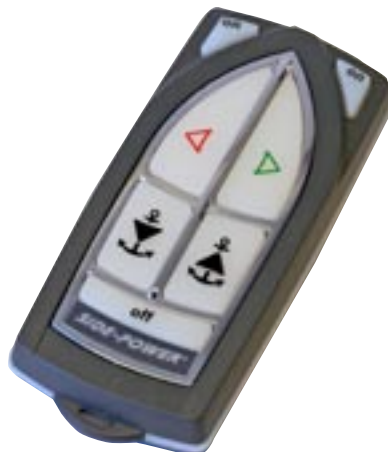
Bow thruster & windlass Kit part code: 8985

Providing full simultaneous control of a bow and a stern thruster or a bow thruster and a windlass, making shorthanded boating a new experience.