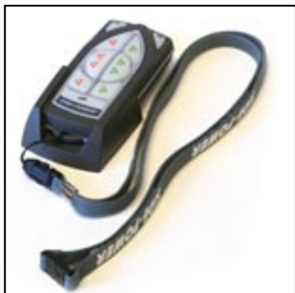
Holder and neck strap included