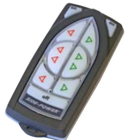
Bow & stern thruster Kit part code: 8980