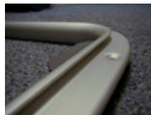
Flanged Lower Frame