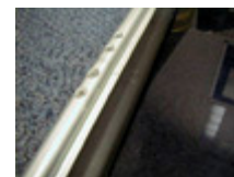
Lid Profile Mark 1 & 2