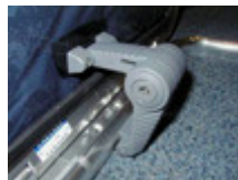
Optional Friction Stay Kit available